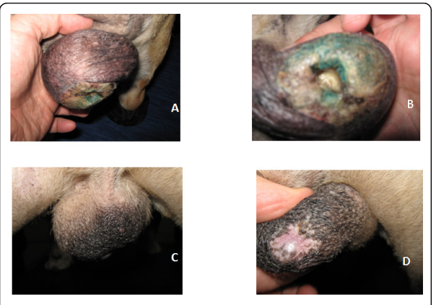
Figure 1 Necrotized scrotal ulcer secondary to lymphosarcoma infiltration in a bull dog at presentation (A & B) and after initiation of rescue protocol (C & D).

oral squamous cell carcinoma. Figure 2 shows the regression of the pancreatic dissemination in the lymphoma patients. The partial responders were a cat with nasal lymphoma and a cat with mammary carcinoma. Interestingly, the two cats with oral squamous cell carcinoma that had stabilization of their disease showed a significant improvement of their quality of life, in terms of decreased bleeding, activity level, interaction with the owners, improved grooming and increased appetite. In